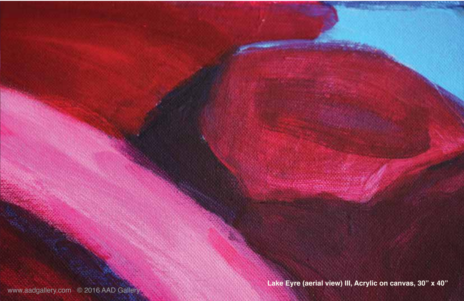
Lake Eyre (aerial view) III, Acrylic on canvas, 30” x 40”