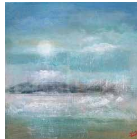
Dreamscape 2 Mixed media on canvas, 12" x 12"