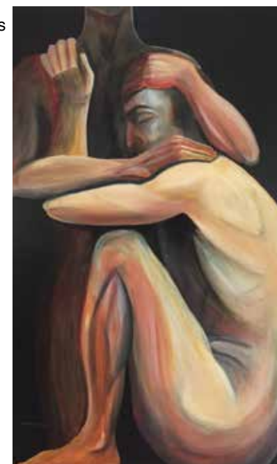
Trust Acrylic on board 40" x 62"