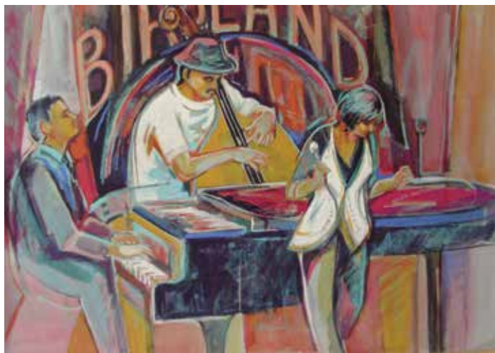
Jazz at Birdland , Gouache on paper, 16" x 22"

Angelika teaches drawing and painting weekly and takes students on workshops in Australia, the Greek Islands and Italy. She is a member of Portrait Artists Australia and NAVA.