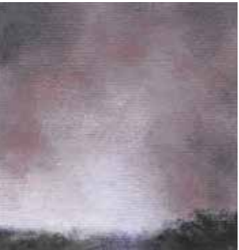
Mist , oil on panel, 4” x 4”