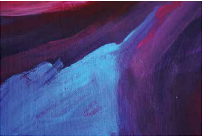
Lake Eyre (aerial view) V, Acrylic on canvas board, 12” x 8”