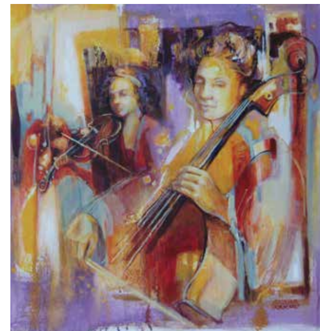
Air on a String , Acrylic on canvas, 24" x 24"