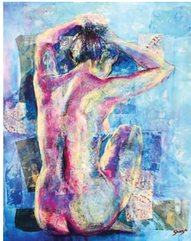
My colourful life Acrylic & mixed media on canvas, 30" x 20"