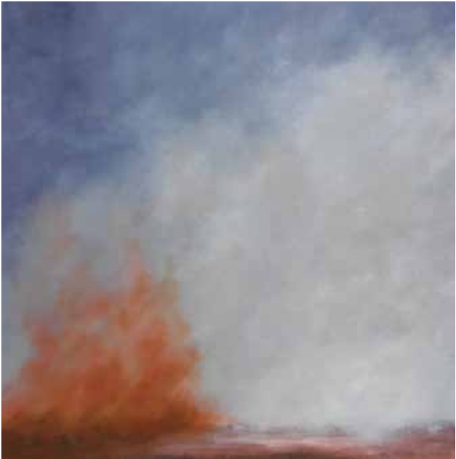
Duststorm , oil on linen, 20” x 20”