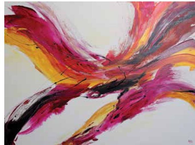
Resonance , Acrylic on canvas, 30" x 40"