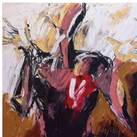
"Let the beauty of what you love be what you do." - Rumi Oil on canvas, 20" x 20"