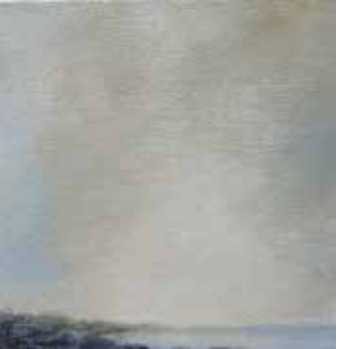
Dawn , oil on panel, 4” x 4”