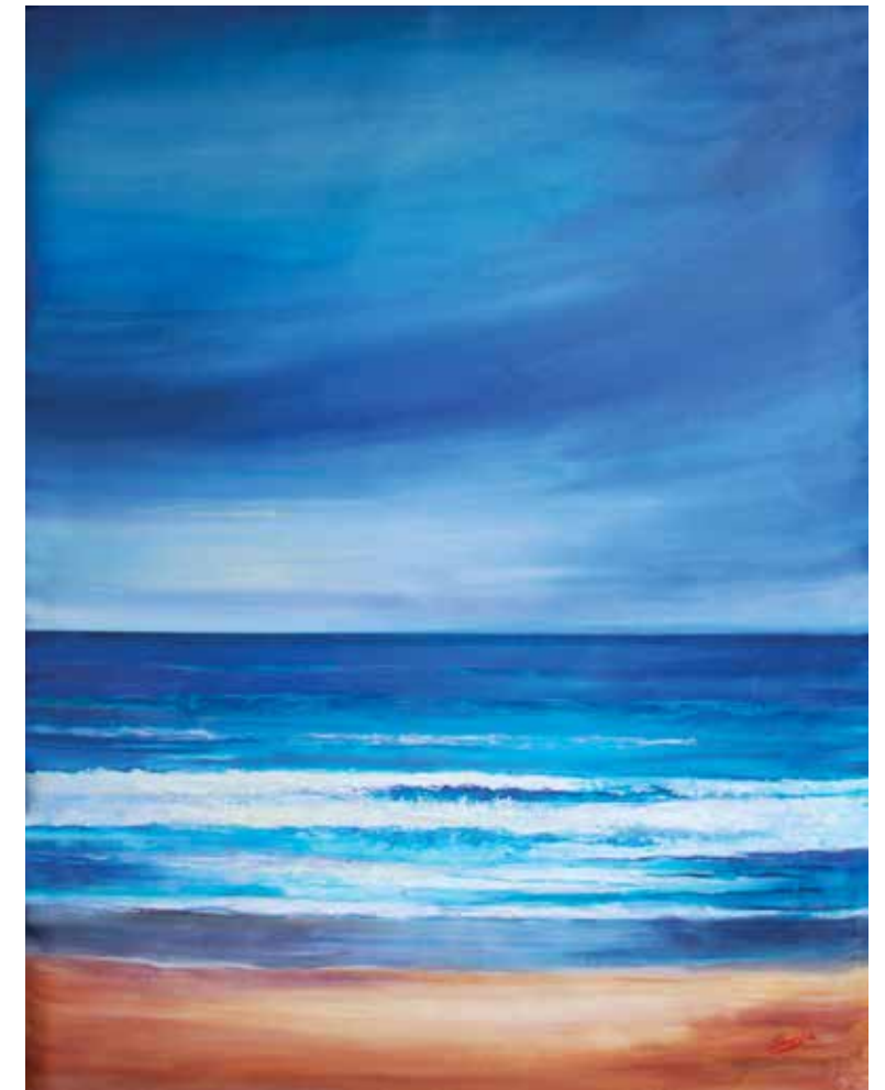
Scape 1 , Mixed media on canvas, 48" x 36"