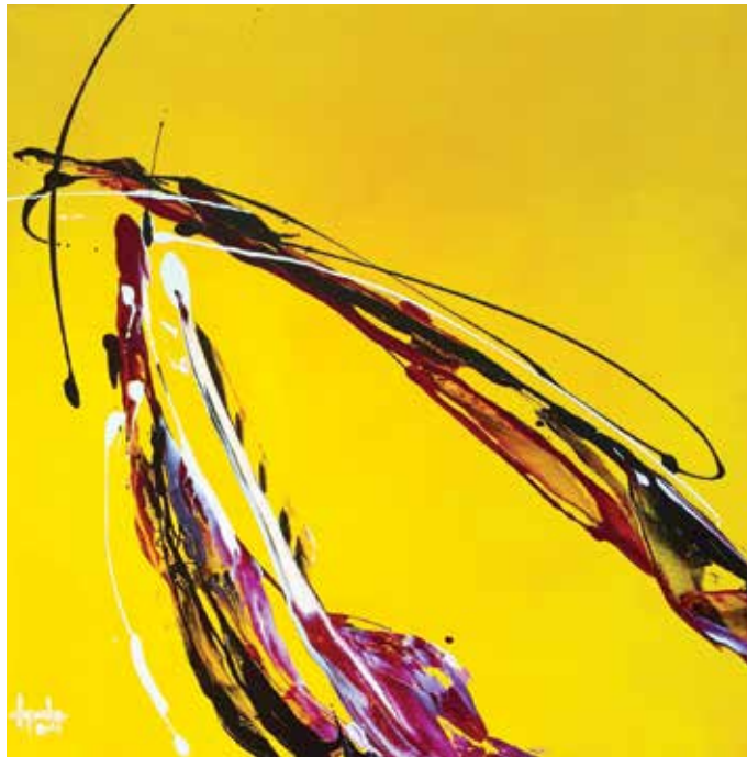
Reach for new heights , Mixed media on canvas, 24" x 24"

Currently I reside in Sydney and have exhibited locally and abroad.