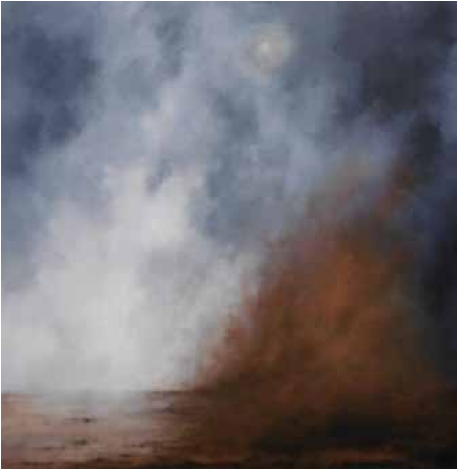
Dust , oil on linen on panel, 28” x 28”