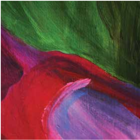
Lake Eyre (aerial view) I, Acrylic on canvas, 20” x 20”