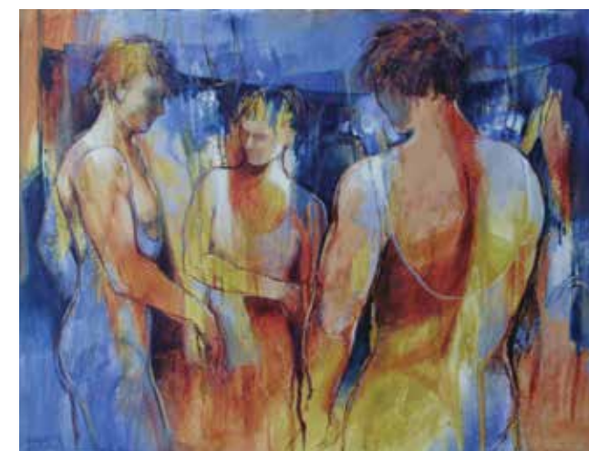
The Trapeze Artists , Acrylic on canvas, 30" x 40"