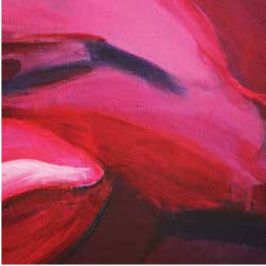
Lake Eyre (aerial view) II, Acrylic on canvas, 20” x 20”