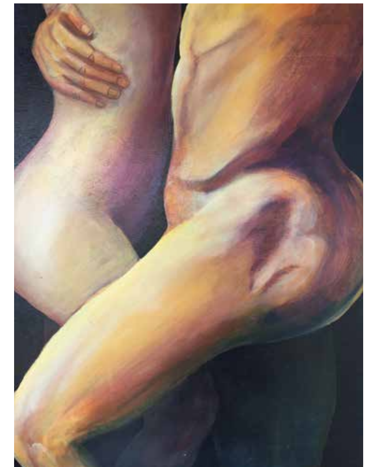
Committed Embrace , Mixed Media on canvas, 30" x 40"