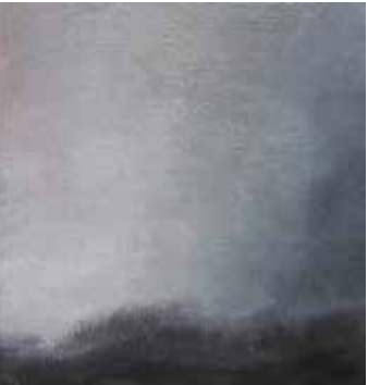
Fog , oil on panel, 4” x 4”