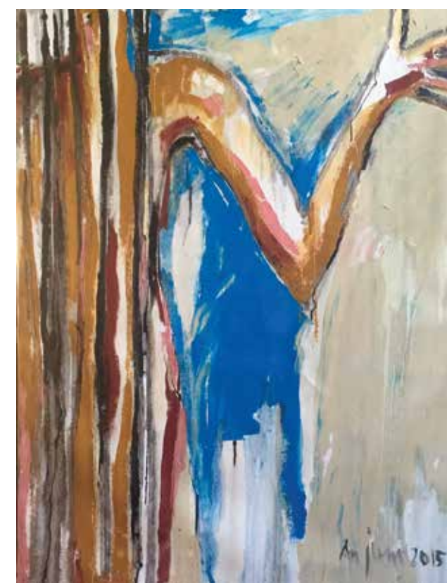
"Be empty of worrying...why do you stay in prison when the door is so wide open? Move outside the tangle of fear thinking." - Rumi Mixed media on canvas, 30" x 40"