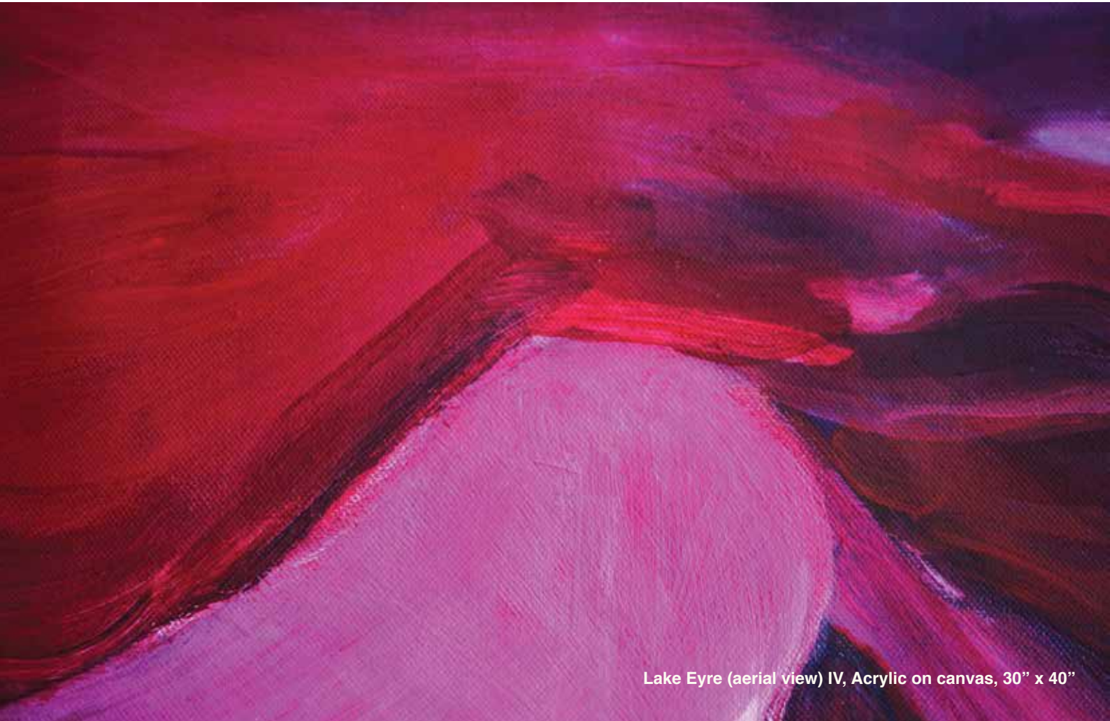
Lake Eyre (aerial view) IV, Acrylic on canvas, 30” x 40”