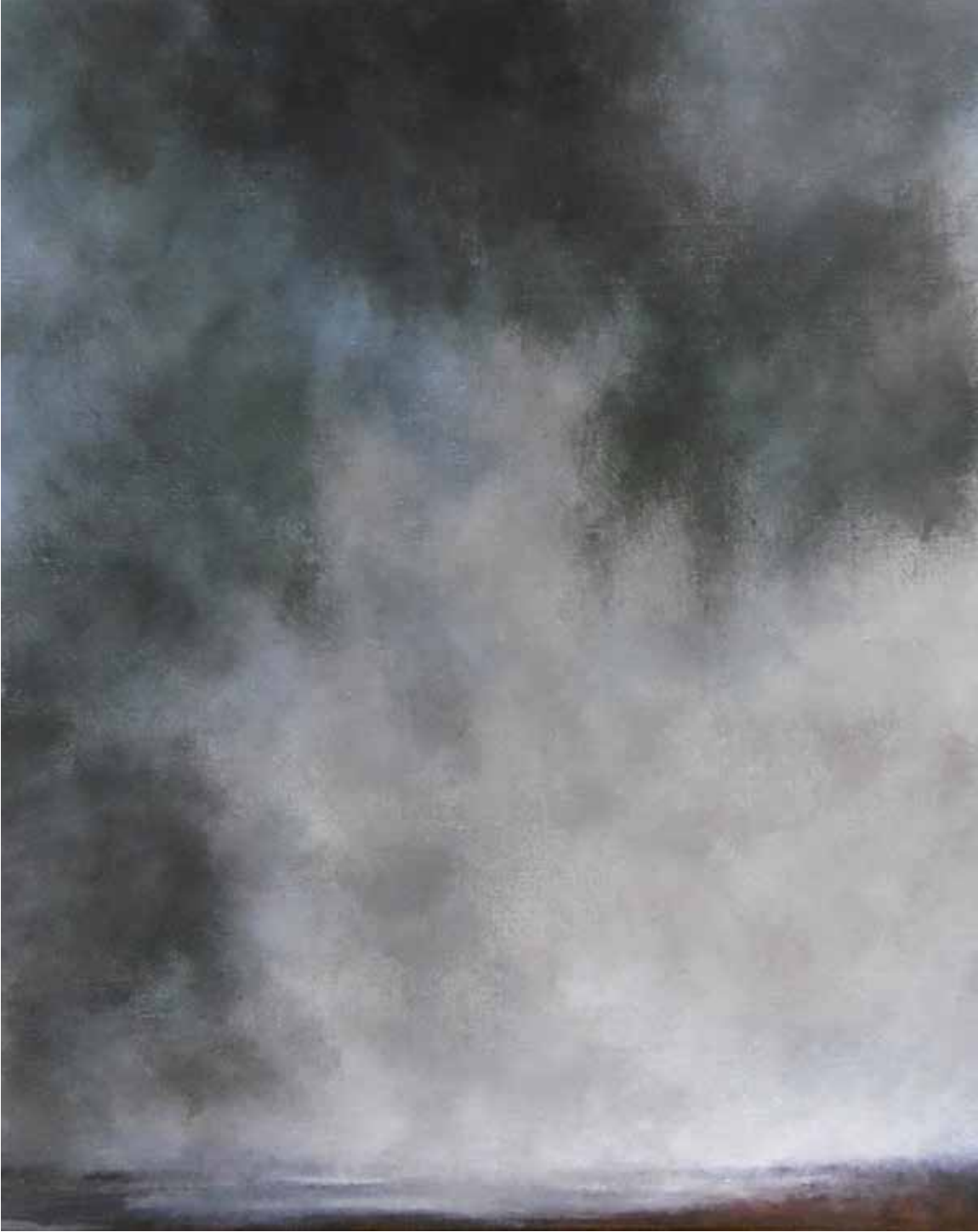
Squall , oil on linen, 20” x 30”