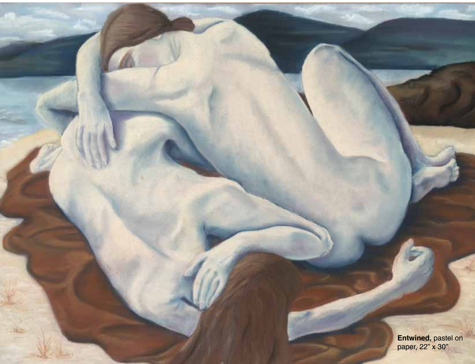
Entwined , pastel on paper, 22" x 30"