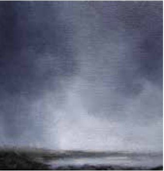
Storm , oil on panel, 4” x 4”