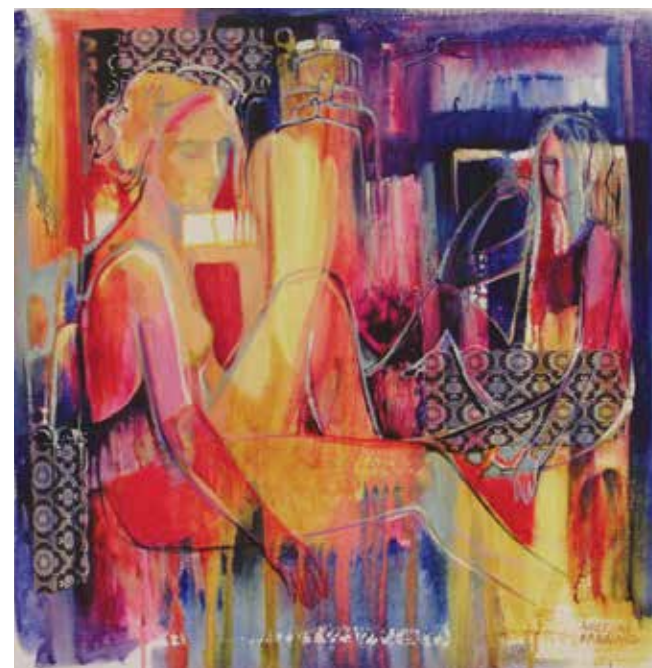
The Dressing Room , Acrylic & collage on canvas, 24" x 24"