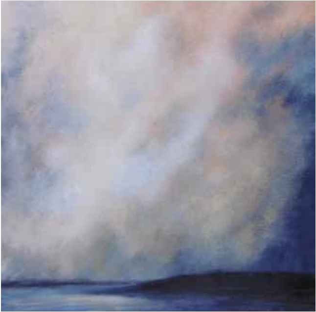
Sunset , oil on linen, 20” x 20”