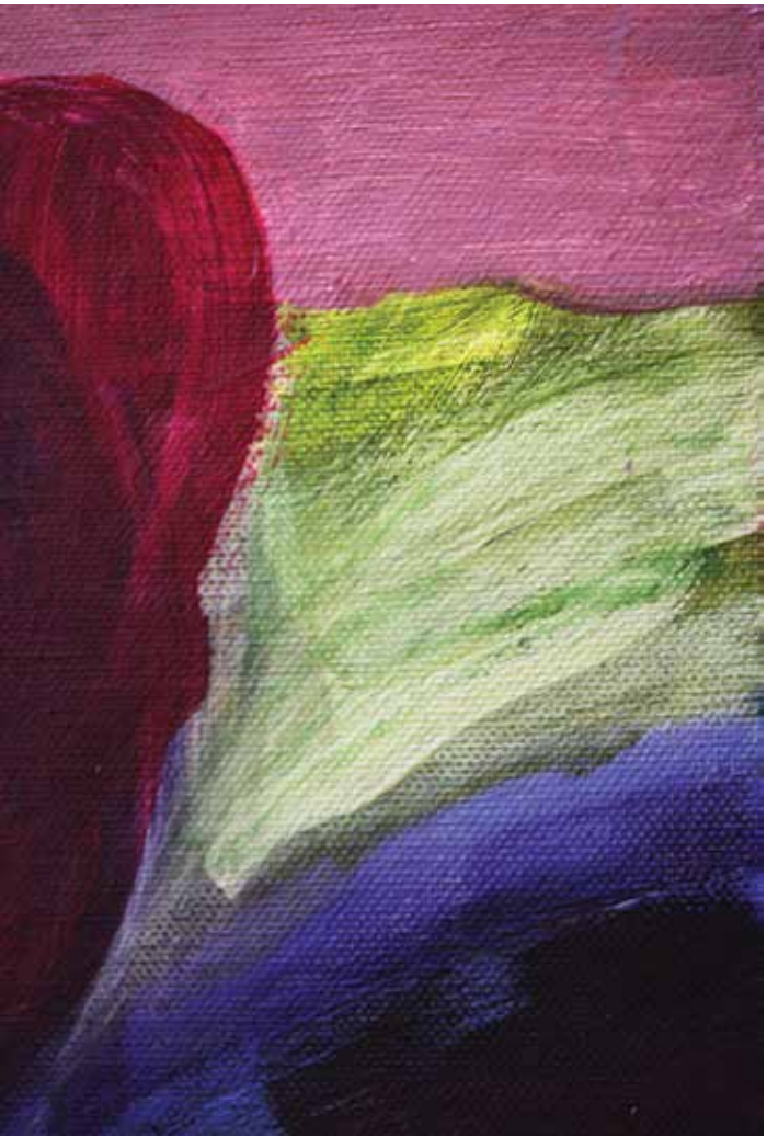
Lake Eyre (aerial view) VII, Acrylic on canvas board, 12” x 8”