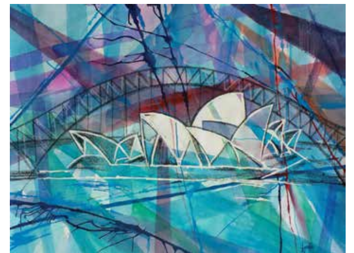
Sydney Blues , Mixed media on canvas, 30" x 40"