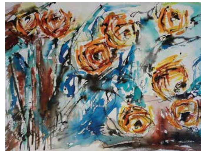
Life's Bloom , Ink & wax on canvas, 30" x 40"