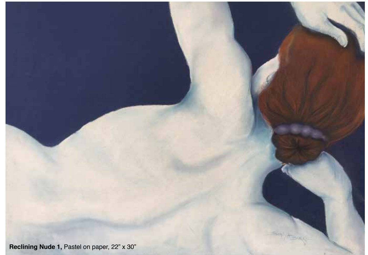
Reclining Nude 1 , Pastel on paper, 22" x 30"