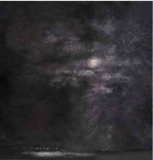
Moonlight , oil on panel, 8” x 8”