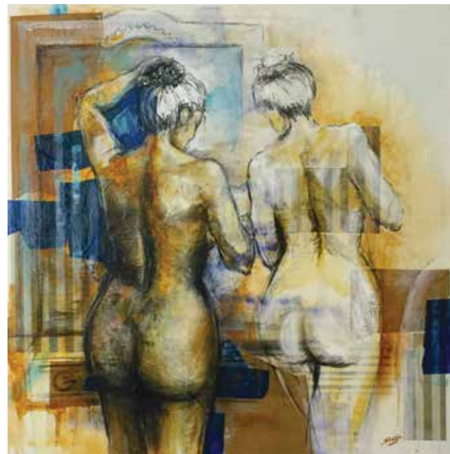
Reflection , Acrylic & mixed media on canvas, 24" x 24"