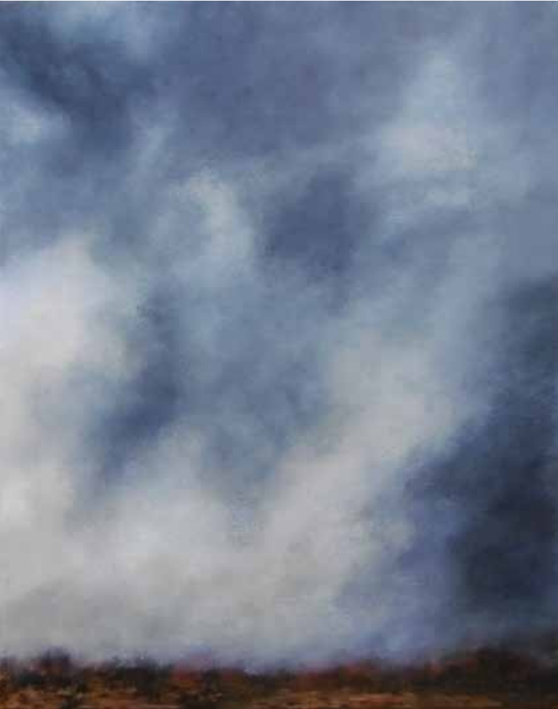
Cloudburst , oil on linen, 20” x 30”

“Contrasting light is the main inspiration behind my landscapes; the complexities and intrigues of capturing these effects and documenting changing weather constitute my main thematic concerns. My work reflects the unpredictability of nature with the emphasis on transitory experience, and the relativity of our status within the natural environment”