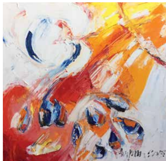
"I want your sun to reach my raindrops, so your heat can raise my soul upwards like a cloud." - Rumi Oil on canvas, 20" x 20"