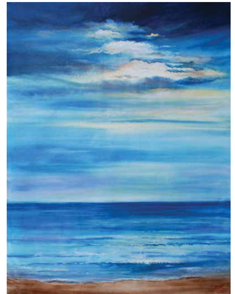
Scape 2 , Mixed media on canvas, 48" x 36"