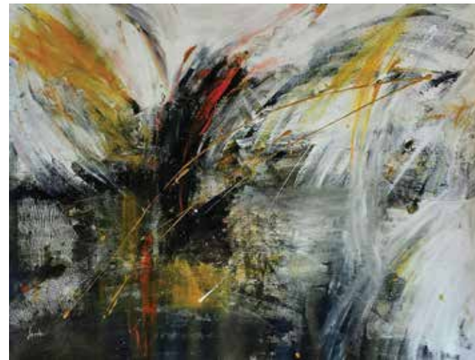
Exuberance , Mixed media on canvas, 30" x 40"