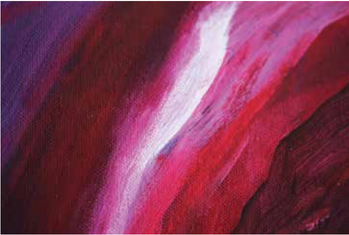
Lake Eyre (aerial view) VI, Acrylic on canvas board, 12” x 8”