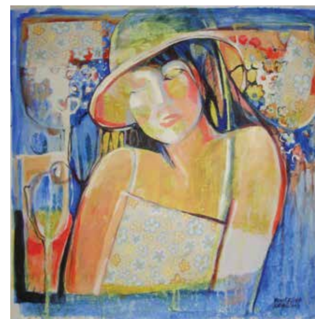
Contemplation , Acrylic & collage on canvas, 20" x 20"