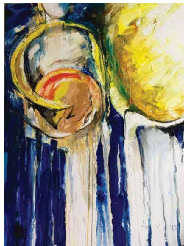
"Rise up nimbly and go on your strange journey to the ocean of meanings...Leave and don't look away from the sun as you go, in whose light you're sometimes crescent, sometimes full." - Rumi Mixed media on canvas, 30" x 40"