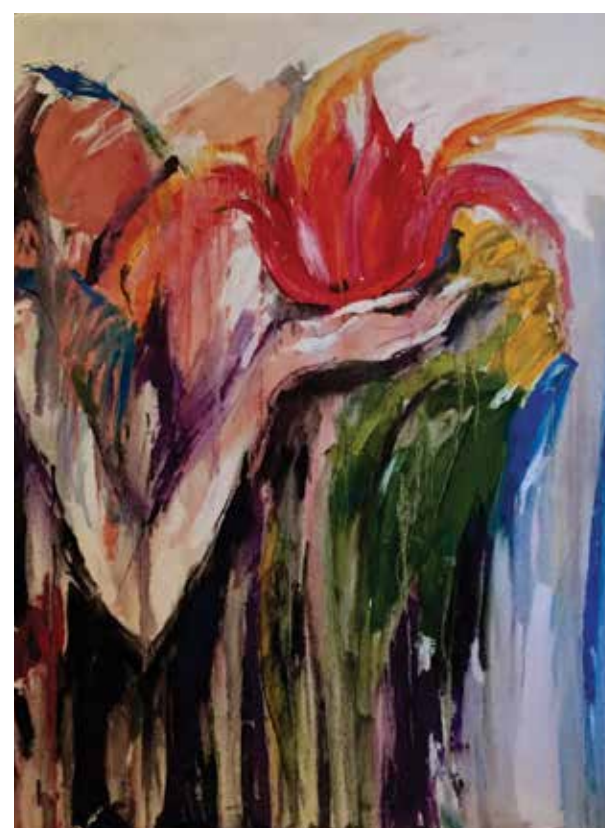
"Let the beauty of what you love be what you do." - Rumi Mixed media on canvas, 30" x 40"