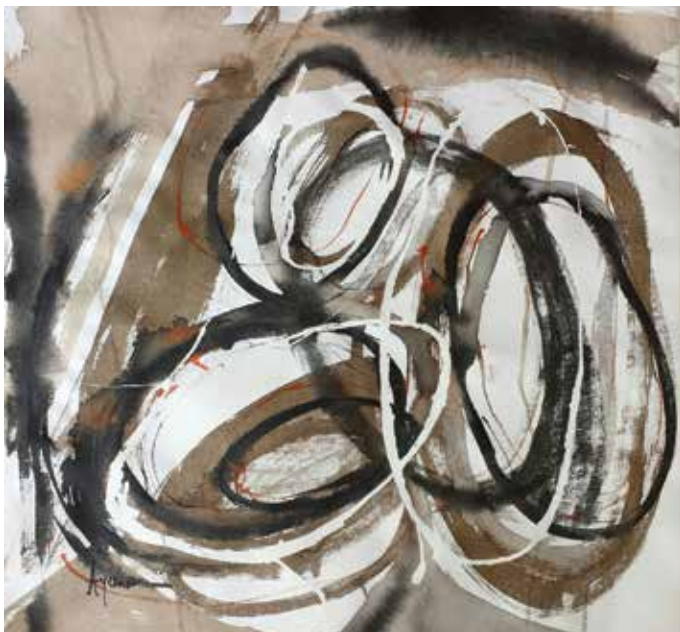
Infinite Wisdom , Ink & wax on canvas, 20" x 20"