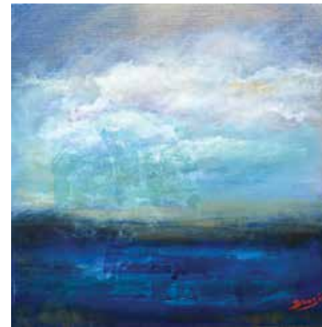
Dreamscape 1 Mixed media on canvas, 12" x 12"