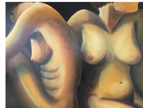
Last Tango Acrylic on canvas 40" x 38"