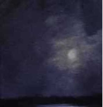
Moonglow , oil on panel, 4” x 4”