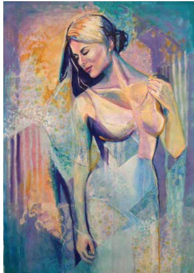
Swirl , Acrylic & mixed media on paper, 22" x 16"

She was invited to participate in 2015 Florence Biennale, where she won the Lorenzo il Magnifico award for her mixed media painting.