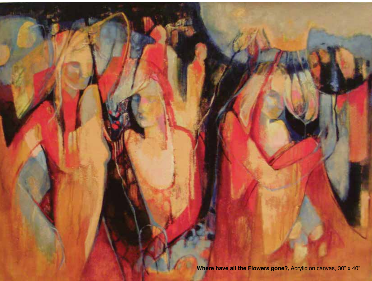
Where have all the Flowers gone? , Acrylic on canvas, 30" x 40"