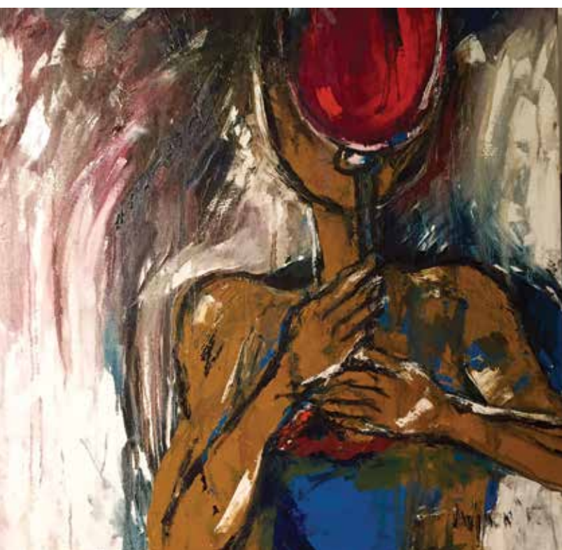
"Is not the cup that holds your wine the very cup that burned in the potter's oven" - Khalil Gibran Oil on canvas, 30" x 30"