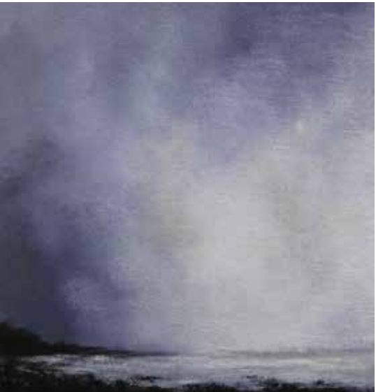
Gale , oil on panel, 8” x 8”