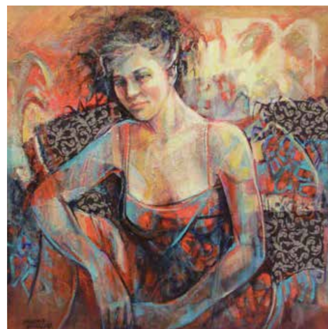
The Dancer , Acrylic & collage on canvas, 24" x 24"