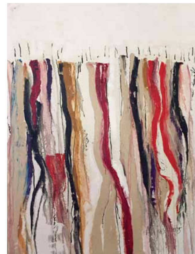
"Don't think the garden lost its ecstasy in winter. It's quiet, but the roots down there riotous." - Rumi Mixed media on canvas, 30" x 40"