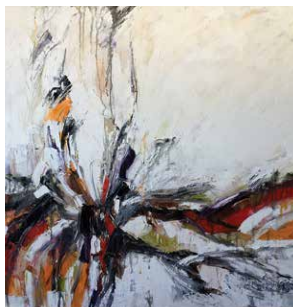
Let yourself be drawn by the stronger pull of what you really love. Oil on canvas, 30" x 30"