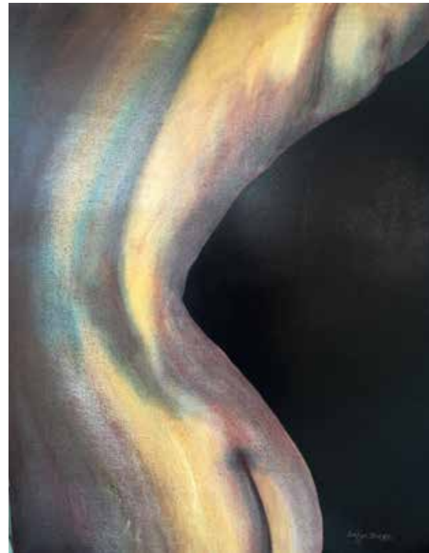
Armoured , Acrylic on canvas, 30" x 40"

She prefers to mainly paint in acrylics and pastels but continues to explore other mediums.