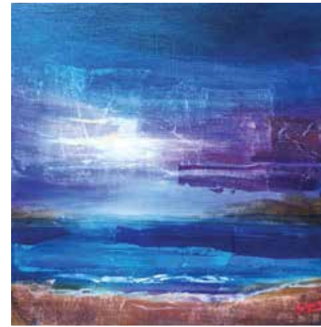
Fusion Mixed media on canvas, 12" x 12"