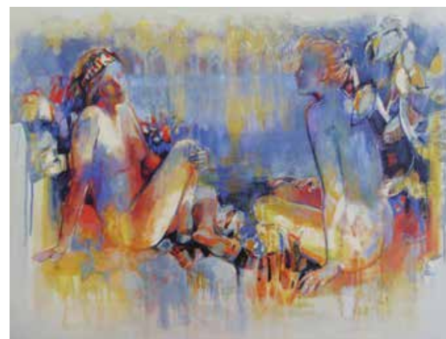
Resting by the Water , Acrylic on canvas, 22" x 28"