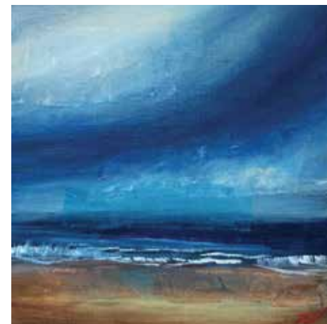
Dreamscape 3 Mixed media on canvas, 12" x 12"