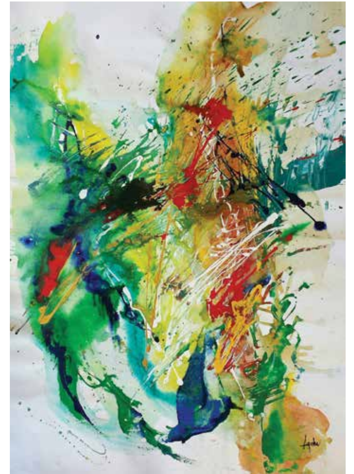
Exultation , Mixed media on canvas, 30" x 40"